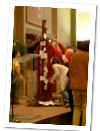
Photo: Placing our requests at the cross

To see pictures & read more: www.angolateam.org/2011/04/angola-day-of-prayer-recap/ . To see the video shown about our Angola & our team go to: http://www.youtube.com/watch?v=-702XH1p3z8